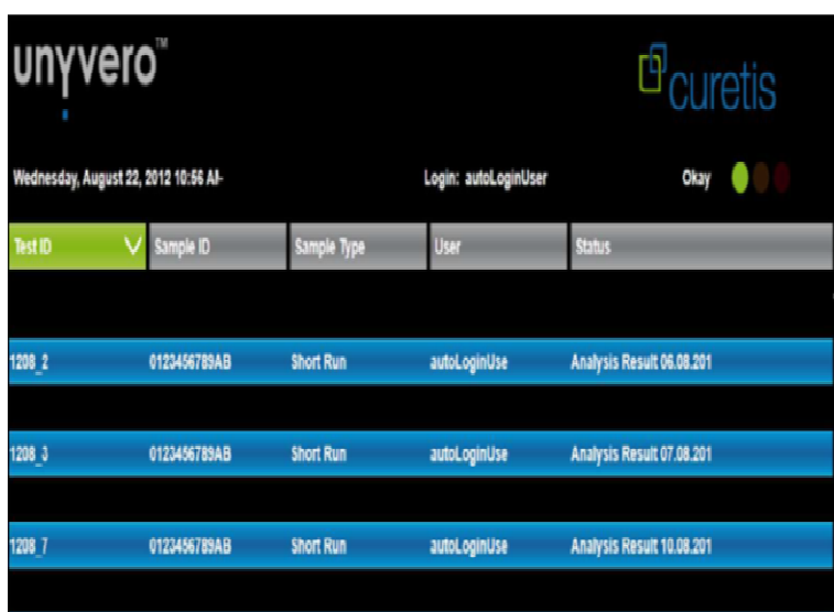
Photo 2. Analysis of the patient samples shown by grey test bars on the overview screen

The Unyvero™ Pneumonia Application achieved an overall sensitivity of 75.5 % (sensitivity per analyte between 50% and 100%, depending on the microorganism) at an overall specificity of 95.2% (72.3% to 100%, depending on the microorganism). For rare pathogens, the number of cases was insufficient to establish sensitivity and specificity data. For detected resistance markers ( mefA , ermA , ermB , ermC , tem , shv , dha , oxa51 like, ctxM , mecA , ebc , quinolone resistances in E. coli and P. aeruginosa ) in 26 cases out of 32 antibiotic resistant pathogens a